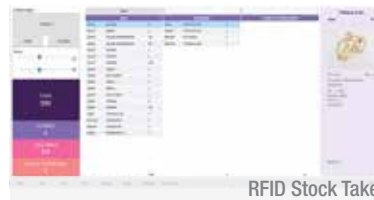
RFID Stock Take