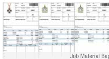
Job Material Bag